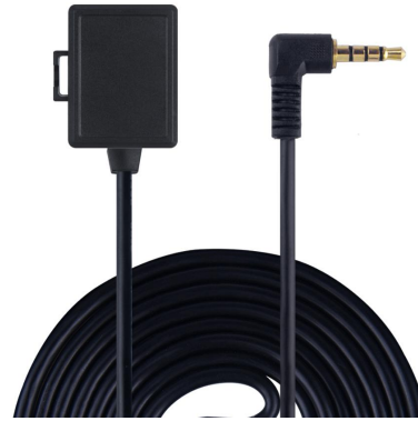
Figure1:GGM-3325-MTR Top View