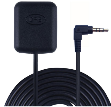
Figure : GGM-4538-MT3WDC300 Top View