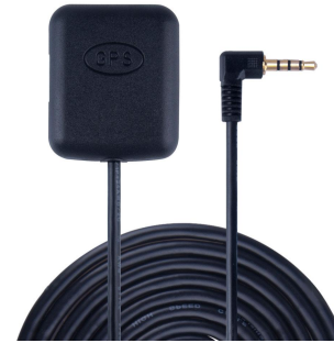
Figure1: GGM-4538-GKBD4WDC150 Top View